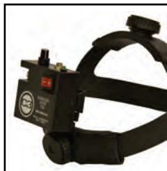
Optional Headband Mounted Battery Pack for Wireless Connectivity Available