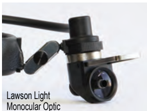
Lawson Light Monocular Optic

The Nova 200-Watt Halogen Light Source powers each of these QED Medical Headlights, the ALOS-TTL Through the Lens Video Headlight System and, via the unique 3-Port Turret many other available headlights & instruments.