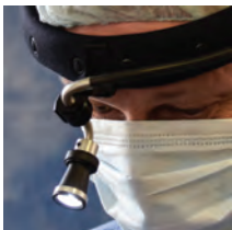
Altair SA Headband or Clip-On