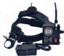
The C3 LED System