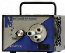
Nova 200-watt Halogen