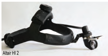
Altair HI 2