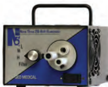
Nova 200-watt Halogen