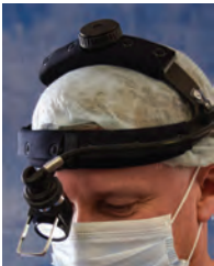
Altair HI 2