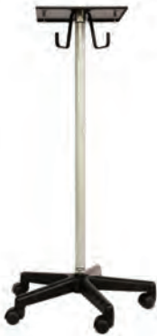
Optional System Stand

Brilliant, long lasting, dependable intensity available at the flick of a switch - these are the trademark features of QED Medical's Nova 300-watt Xenon light source. With 1,000 hour lamp-life, specifically designed cooling fan and multi-port rotating turret configured to accept QED, BFW, ACMI, Wolf, Storz and Olympus cables, the Nova 300 brings the versatility and functionality to the OR you demand.