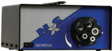
Nova 300-watt Xenon