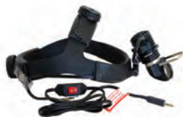
The Centauri 2 Halogen System