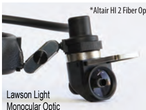
Lawson Light Monocular Optic

The Beamer 10-Watt LED Light Source powers each of these QED Medical Headlights, the ALOS-TTL Through the Lens Video Headlight System and, via the 3-Port Turret, many other available headlights, lighted instruments & retractors .