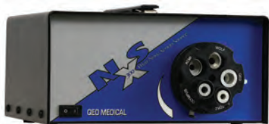
Nova 300-watt Xenon