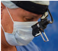
Lawson Light Monocular Optic