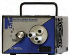
Nova 200-watt Halogen