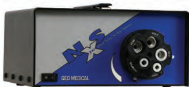
Nova 300-watt Xenon

The Altair HI 2 provides exceptional intensity from any QED Medical Light Source and others.